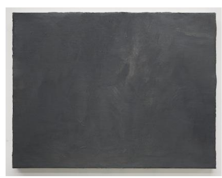
David Schutter, GSMB W 21, 2014, oil on canvas, 37 x 48cm. Courtesy the artist and Rhona Hoffman Gallery, Chicago

David Schutter's quasi-monochromatic oil paintings are both luminous and grey, a deft riposte to Wittgenstein's claim that the two cannot co-exist. Viewed close-up, his canvasses are like mirrors, seeming to represent space more vast and airy than four corners allow. But seen at a few steps away from the wall, the illusion dissolves and the paintings solidify into minimal, leaden blocks of material. Schutter challenges many formal and conceptual expectations in his rigorous pursuit of painting as both a noun and a verb. His work since 2009 has recently been the subject of two exhibitions in Chicago, the conventional installation of which – modestly-sized paintings made with traditional techniques, hung at eye level on white walls – might have belied his subversive inventiveness. <sup>2</sup>