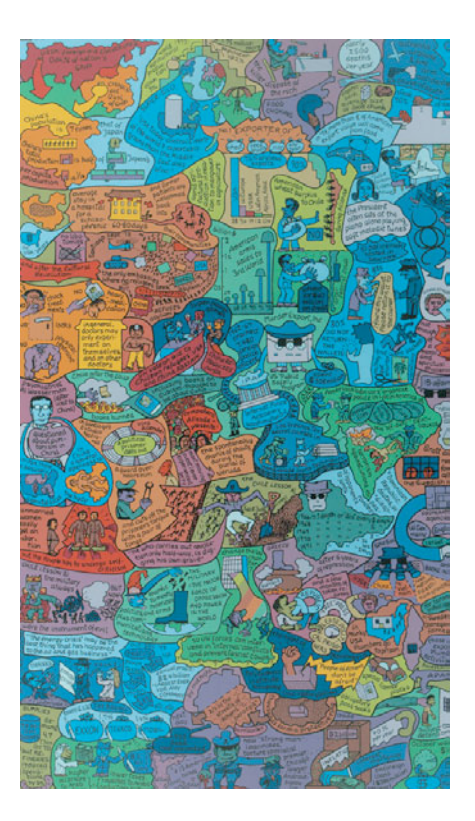
Image: Detail from Öyvind Fahlström, Column no. 4 (IB-affair), 1974, silkscreen (twenty-six colors), 75.9 x 56.4 cm, 29 7/8 x 22 3/16 in., edition: 300, signed, dated

Since our Fahlström exhibitions in 1991 and 2001 there has been increased discussion surrounding this extraordinary artist. International attention to his work has grown markedly, indicated by the retrospective initiated by IVAM in Valencia in 1992, by the traveling show "The Installations" at GAK in Bremen and at the Kunstverein in Cologne in 1995-96, followed by the presentation at the documenta X in 1997. In 2000 the MACBA organized a touring retrospective exhibition with venues in Europe and the USA and published a thorough accompanying catalogue. Daniel Birnbaum placed the artist at the center of his "Making Worlds" exhibition at the Venice Biennale in 2009.