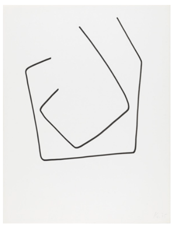
"75/063", ink on paper, 64,5 x 49,5 cm

Berlin – In his historic spaces at Schöneberger Ufer, Aurel Scheibler is showing an exhibition dedicated to the German sculptor and draftsman Norbert Kricke (1922-1984). This is the first time that the oeuvre of one of the most revolutionary and important post-war sculptors is presented in a solo exhibition in Berlin. "Norbert Kricke" focuses on sculpture and drawing from the 1950s and 1970s and emphasizes the distinct relationship that exists between Kricke's early and late work. The exhibition runs until Sunday 30 November.