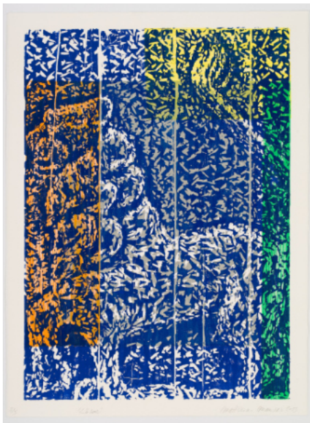
Matthias Mansen, Leo , 2023 Colour woodcut, 76 x 56 cm Ed. 5 plus 3 AP